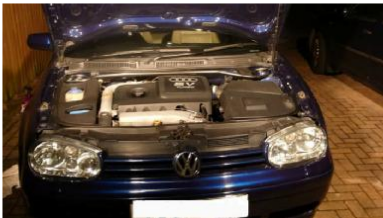
Audi TT engine, manifold and covers tucked neatly into Golf engine bay

Am definitely enjoying my Octavia and the simplicity and ease it brings along with power when I need it and 4x4 muscle- roll on Winter!!