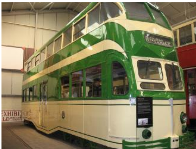
My own personal favourite