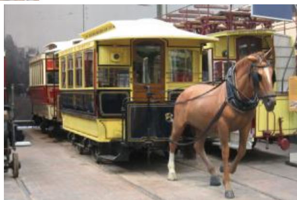
inside the exhibition of trams through the ages