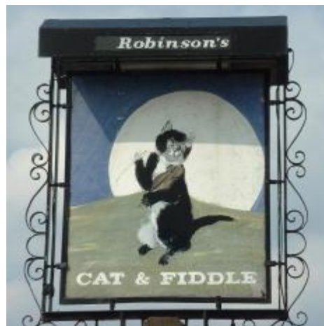
The Cat & Fiddle pub after which the A537 is named