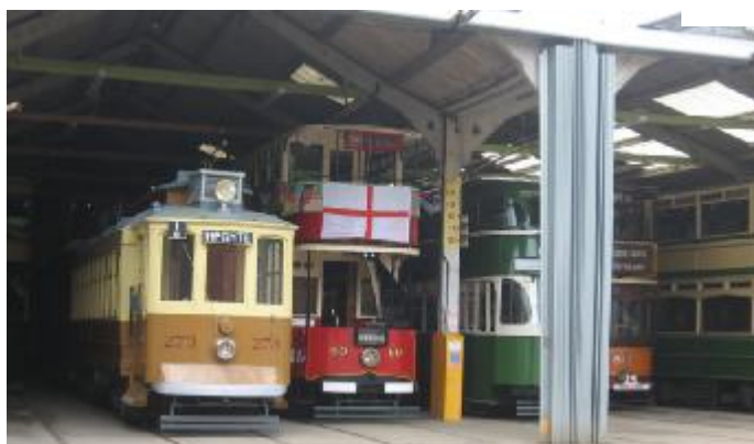
Part of the shed packed full of trams