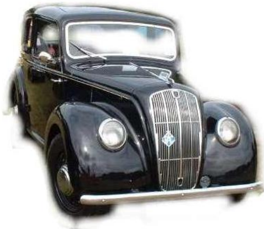
1948 Morris 8

Trafficators were fitted to several different vehicles in those days, but I believe the shape of the arm was always the same, with its distinctive triangle at the end, holding the bulb. It's said that this shape was derived from the diamond-ended signal arm in use on the Royal Bavarian Railway at the end of the nineteenth century, with half of the diamond removed so as not to stick out when the trafficator was retracted. Thus it is that a little bit of history connects with us.