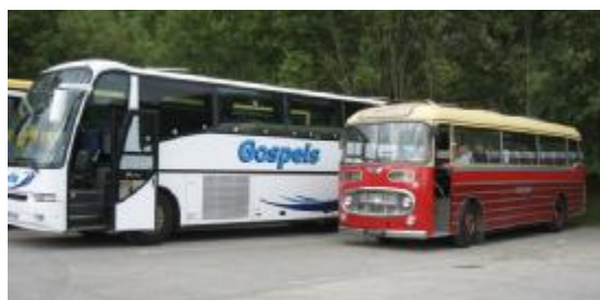
Our dinky coach!