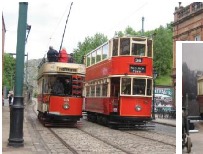
Two of the trams passing each other